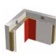
Internal corner panel / folded panel type