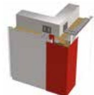
External corner panels / hood type