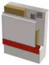
Bottom of cladding / Bottom of cladding panel