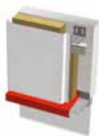
Openings / Edge support and vertical trimmer

Other flashings: can be custom- made on request