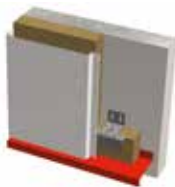
Bottom of cladding with drip edge