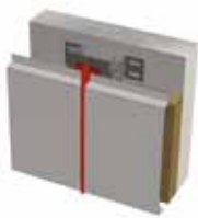
Junction between panels / with pointer