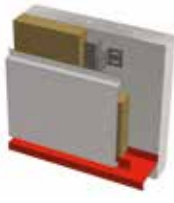
Bottom of cladding/ Bottom of cladding and drip edge