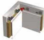
Internal corner panel / W shaped internal corner flashing