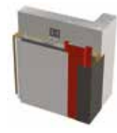
Junction at existing wall