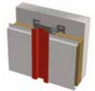
Junction between panels / with shadow gap