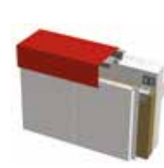
Top of cladding / Parapet coping