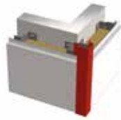
External corner panel / Standard external corner flashing