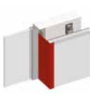
Openings / Single Jamb