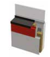
Openings / Horizontal edge support

Other flashings: can be custom- made on request