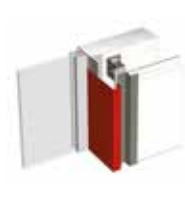
Openings / Shadow gap jamb