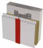
Junction between panels / with inverted pointer