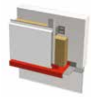
Openings / Horizontal Batten