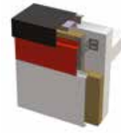
Top of cladding / horizontal parapet trim and coping