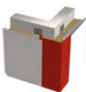
External corner panels / folded panel type