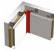
Internal corner panel / Accordion shaped internal corner flashing