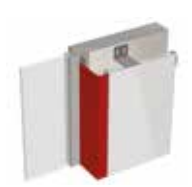
Openings / Jamb in clips